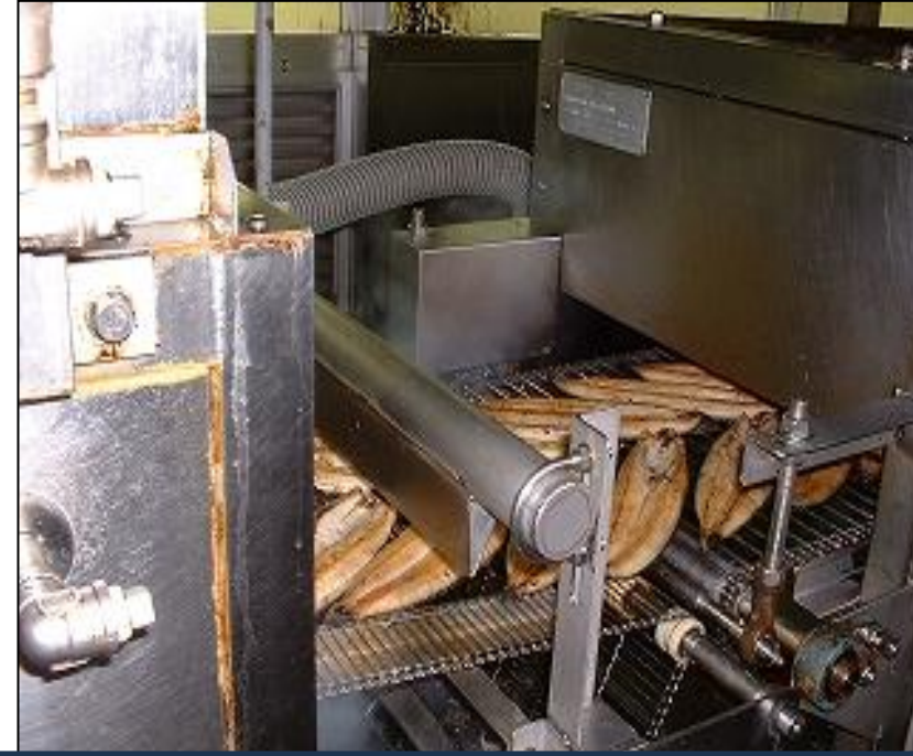
Grill & steam