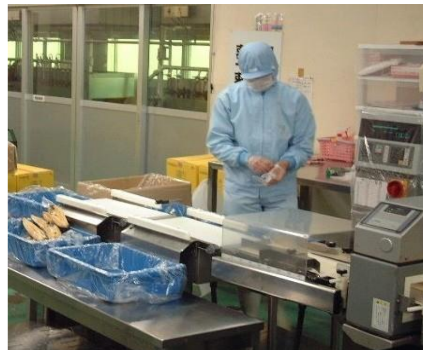
Weight and metal inspection