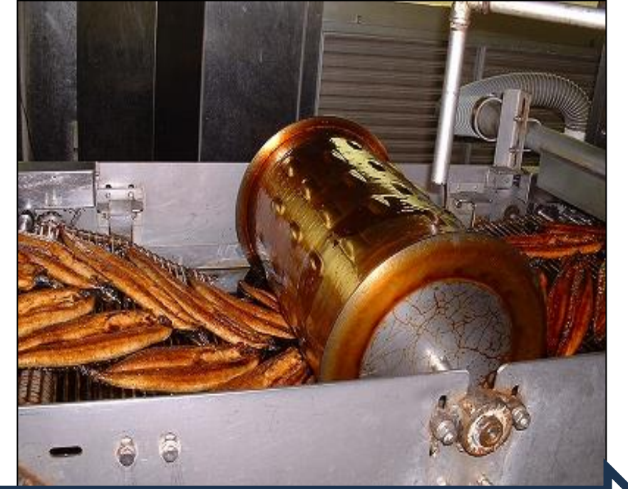
Grill with sauce