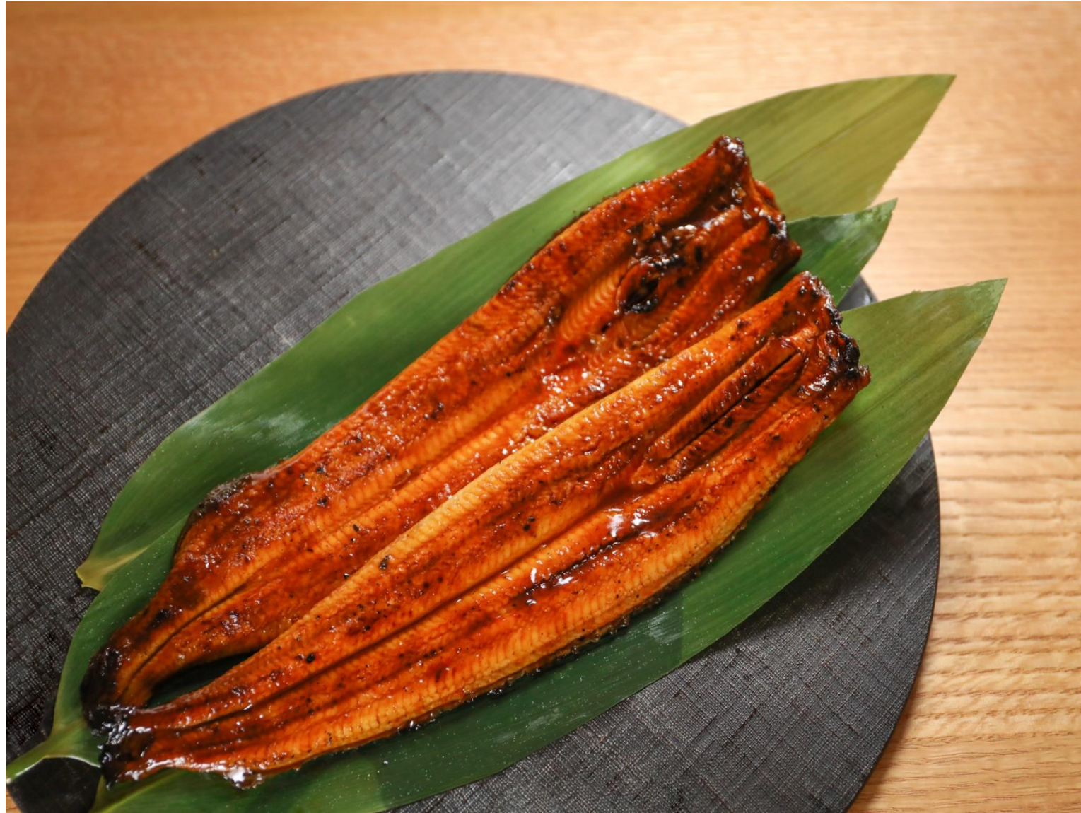
Our new product "Frozen grilled eel"